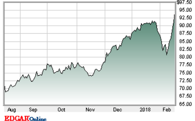
RELIANCE STEEL & ALUMINUM CO as of 2/16/2018