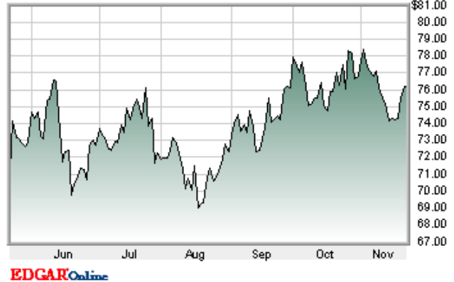
RELIANCE STEEL & ALUMINUM CO as of 11/22/2017